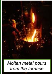
Molten metal pours from the furnace